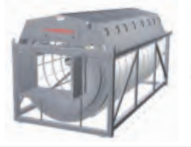
Type 2F, Open inlet (incl. connection for inlet channel)