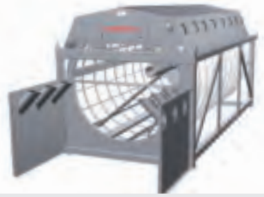
Type 2, Wing walls